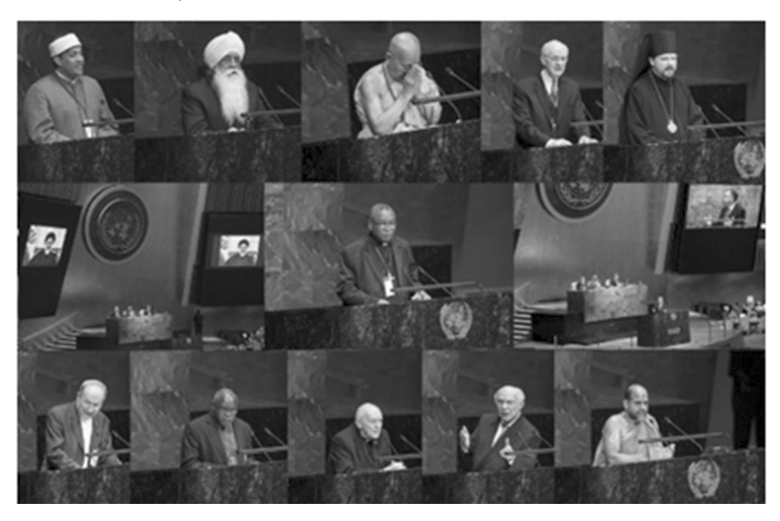
Faith leaders at the UN event on 22 April 2015.

The misuse of religion to lure the young into terrorism and violent extremism was in focus at the United Nations this week with events featuring faith leaders and youth from around the world.