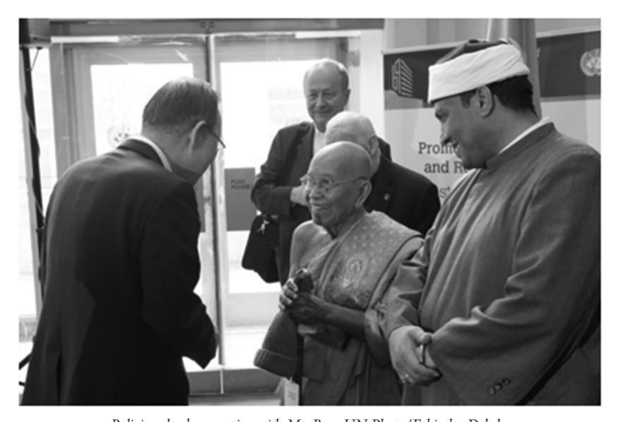
Religious leaders meeting with Mr. Ban.

"I urge you to use your spiritual and moral influence to counter their narrative by standing up for moderation and mutual understanding," added Mr. Ban. He noted also that "we expect our religious leaders to be brave, and to teach their followers when they see something morally wrong."