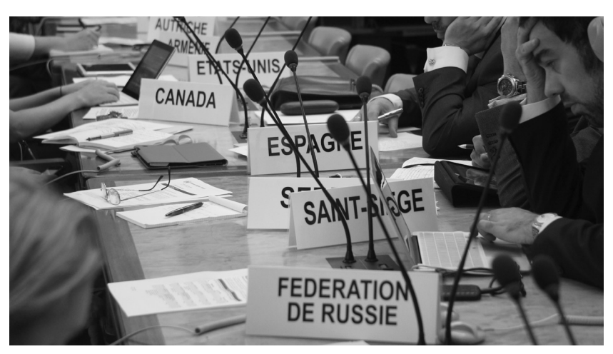
View of the participation of different UN missions at the Side-Event organized in Geneva by the International Association for the Defense of Religious Liberty, an event co-sponsored by the Council of Europe, Uruguay, Canada, Spain and Norway.